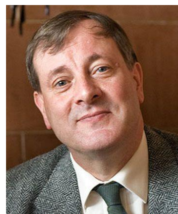
Professor Alister McGrath

This handbook is intended to provide an orientation, and to point you to some of the resources in the Faculty, your college and the wider university, which you can draw upon in order to make best use of your time as a graduate student. In addition to this, you should also consult the current Examination Regulations, which contains full and authoritative details of the syllabus and other requirements for your degree programme (please see your specific course pamphlet). Examination regulations will be available in early October 2019.